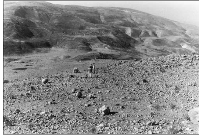
1. MN 360. A Middle Palaeolithic open-air site found on the surface of a Pleistocene terrace along Wādī Jadīdah, 560-580 metres above sea level. The artefacts are still in situ , alongside nodules of flint (September 1994).

Before dealing with the problem of the apparent lack of Upper Palaeolithic sites, it should be noted that in two cases traces of Epipalaeolithic occupation were found at tiny south-facing shelters north-