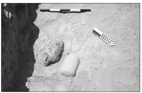
9. Trench H.2 showing two intact vessels discovered in situ.

A 2.5 x 2m probe was opened at Khirbat Umm Qanṭara to examine the ancient cistern ( Fig. 10 ). The main goal was expose the floor of the cistern in order to ascertain its depth, which in turn would allow the volume to be calculated. The probe was opened in the south-east corner of the cistern, where a water channel approaches the cistern from the north-east and connects to