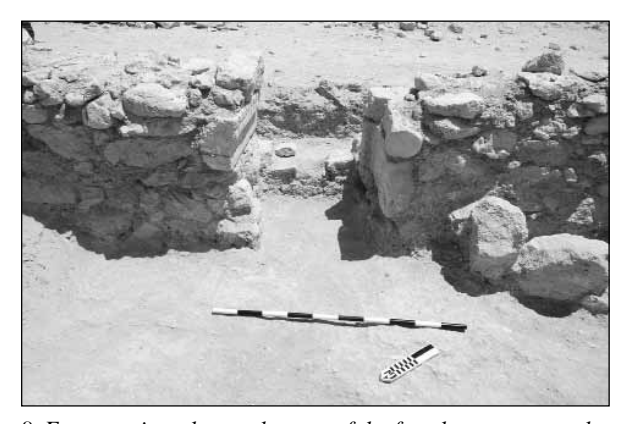
8. Entrance into the south room of the farmhouse — note the re-used Nabataean block on the left side of the entrance.

Because the material culture from Trench H.1 was inconclusive with respect to confirming the function of the structure as a farmhouse, Trench H.2 was opened in the room to the north with a 3.5 x 1.5m probe along the east well. The soil matrix from the probe in Trench H.2 was similar to that of Trench H.1 to the south. From