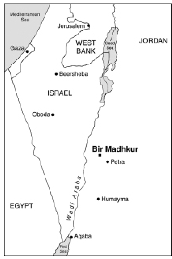
1. Map of the region showing location of Bir Madhkūr.

through archaeological and ethnographic research. Wādī 'Arabah is part of the Great Rift Valley that extends ca 160 kilometers north from the Gulf of 'Aqaba to the Dead Sea. Bīr Madhkūr lies in the foothills of Wādī 'Arabah ( Fig. 1) and was one of the first major way-stations along the ancient Incense Road that crossed the Araba valley west of Petra. Prominent archaeological remains at Bīr Madhkūr include a Roman / Byzantine fort or castellum , which measures just over 30 × 30m, a (presumed) bath building,