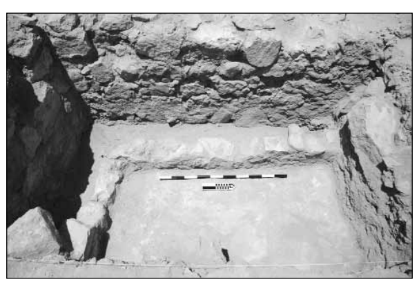
6. Trench B.1 showing the apparent latrine installation.

Trench B.2 was partially excavated to find some relation between the features of the presumed bath complex with the larger, attached structure to the north: the possible caravanserai. A doorway was uncovered that opens to the west. How this area and corridor relates to the