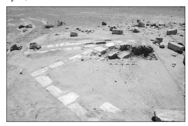
10. Buried reservoir at Khirbat Umm Qanțara.

No trenches were opened at Khirbat Sufaysif, but the site was revisited in order to as-