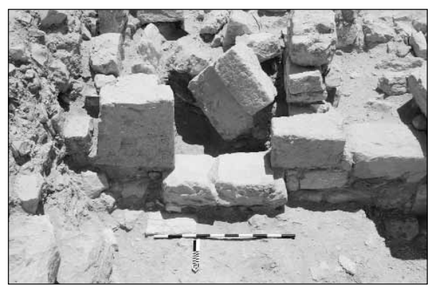
4. Trench A.2. showing portal gate along north wall of the fort.

Ceramics uncovered from the excavations in Area A provide a tentative and relative dating for the occupation of the fort, although it should be stressed that most of the evidence is all extramural. The latest pottery recovered from Trench A.1 above the foundations dates from the ear-