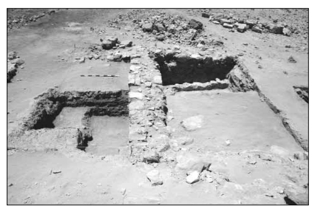
5. Overview of Trench B.1.

south-west corner room with respect to the overall complex remains unclear. The north room uncovered in Trench B.1, on the other hand, revealed significant architectural features that can plausibly be associated with a bath complex. A small plastered stone wall, for example, was found running parallel to the large, exterior walls of the room from which it was separated by a channel, which would suggest some sort of hydraulic function for the room ( Fig. 6 ). The floor of the room, built directly atop a sterile layer of alluvial fill, was also plastered. It may be that this room functioned as a latrine, although this interpretation is tentative. There is a possible parallel at 'En Hazeva across Wādī 'Arabah to the north-west (see Hoss 2005, Cat. #59). Pottery from Trench B.1 was mostly Roman and Byzantine.