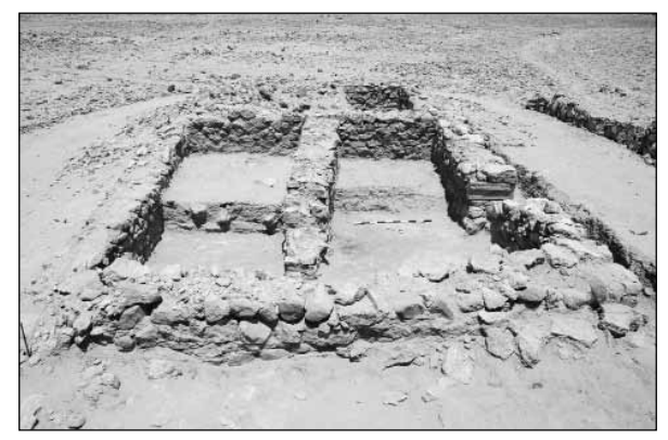
7. Overview of the farmhouse (Area H) with Trench H.1 in the foreground.

Two 5 x 5 m trenches (H.1 - 2) were opened in Area H, a farmhouse (9.70 m N - S x 4.70 m E - W) in the agricultural area west of Bir Madhkūr ( Fig. 7 ). The goal of the excavation