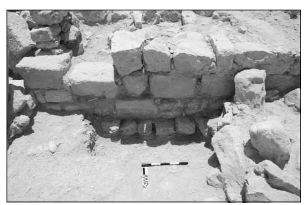
3. Trench A.1 showing the north wall of the fort and the wall foundation.