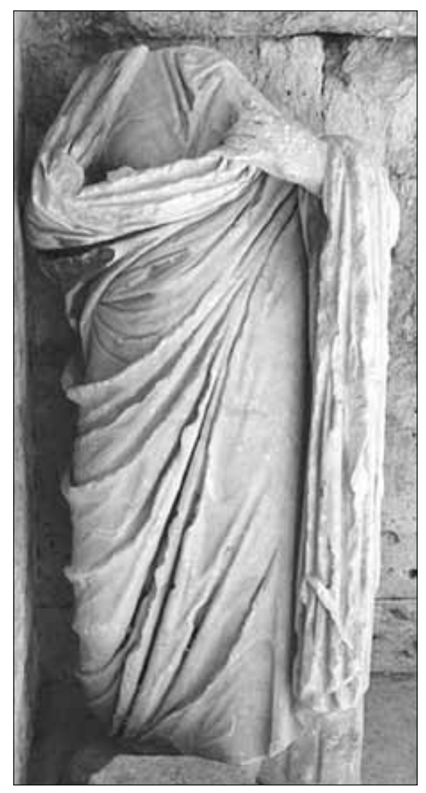
Draped female, late Hadrianic/early Antonine period (125-175 AD), marble, Roman Theater, Amman (exact findspot unknown).

The over-life-size statue of a cuirassed emperor ( Fig. 1 ) stands 1.18 m tall, preserving the torso and upper legs of one of the Antonine emperors (El Fakharani 1975: 399-400; Stemmer 1978: 25, II 4a; Vermeule 1978: 104-105; Weber 2002: 509-510; Gergel 2004: 400). Though there is not enough evidence to determine whether the statue represented Hadrian or Antoninus Pius, the composition of the breastplate and the motifs on the lappets are best associated