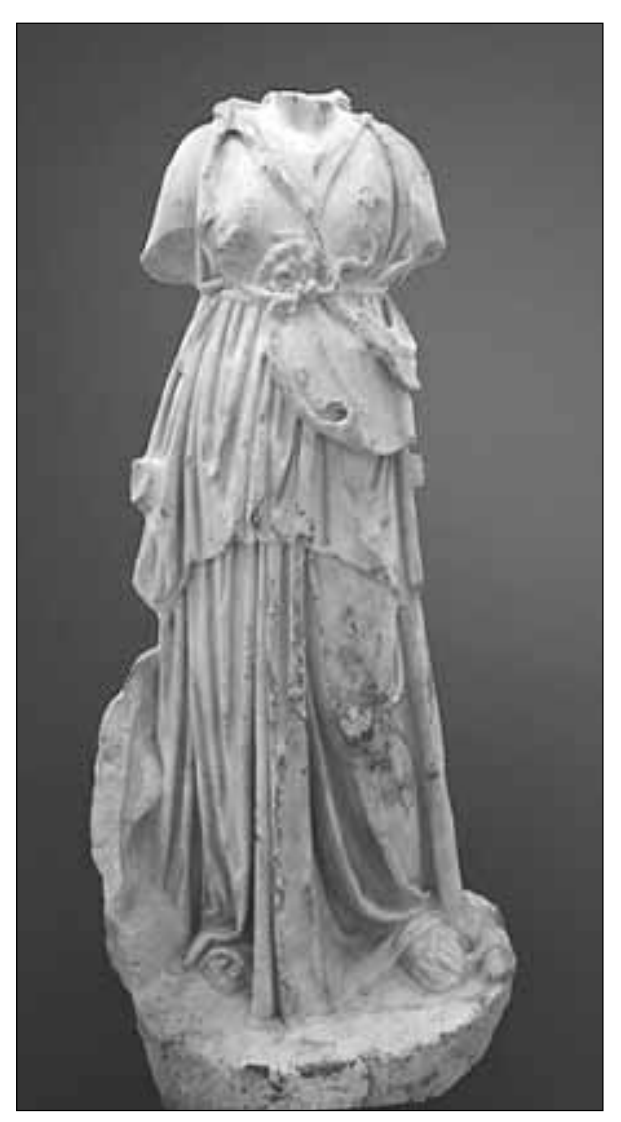
4. Athena Hephaisteia, 150-200 AD, marble, Roman Theater, Amman (exact findspot unknown).

Also from the Theater in Amman and of comparable scale to the over-life-size statue of a cuirassed emperor is an over-life-size statue of a draped female ( Fig. 2 ), which stands 1.46 m tall and preserves the torso, most of the legs, and portions of both arms of the figure (El Fakharani