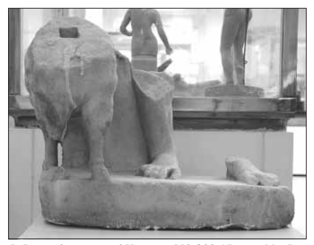
5. Base of a statue of Hermes, 150-200 AD, marble, Roman Theater, Amman (exact findspot unknown).

Asklepios of the Florence type ( Fig. 3 ) stands .76 m tall and preserves the torso from the base of the neck to just below the navel as well as the figure's left arm (Weber 2002: 505-506). The god wears a mantel that is pulled diagonally across the back, flows over the left shoulder and down the left side of the body, and crosses the front of the torso horizontally over the navel. Where the body is exposed, the musculature is modeled naturalistically. The piece has been dated stylistically to the second half of the second century AD (Antonine period) and has been identified as a replica of the cult statue of the Pergamene Asklepieion (Weber 2002: 505-506).