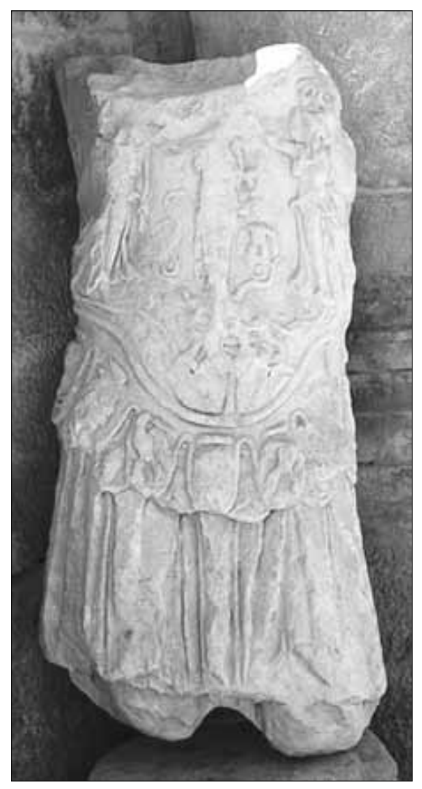
1. Cuirassed Roman Emperor, late Hadrianic/early Trajanic period (125-150 AD), marble, Roman Theater, Amman (exact findspot unknown).

2004: 400). This inscription associates the date of renovation and decoration of the stage building with Antoninus Pius, though it does not provide a secure date for the construction of the theater itself or for the individual statues discovered within its ruins. Five statues were uncovered in the excavations of the theater (though their exact findspots are unknown): the torso and upper legs of a larger-than-life-size cuirassed Roman emperor ( Fig. 1 ); the body of a larger-than-life-size draped female ( Fig. 2 ); a larger-than-life-size torso of an Asklepios of the Florence Type ( Fig. 3 ); the body of a miniature Athena Hephaisteia