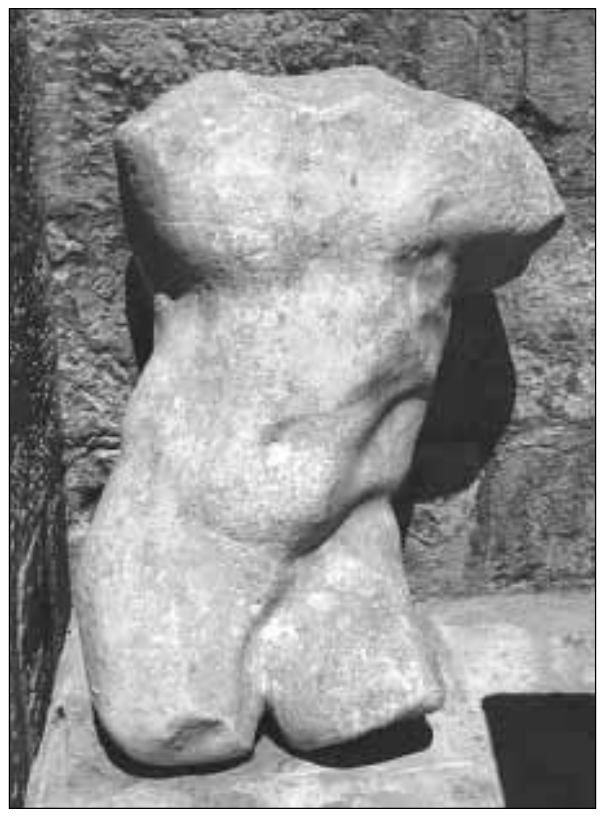
6. Herakles (probably Farnese Type), 2nd or 3rd century AD, marble, found in a river bed near now-demolished Philadelphia Hotel, Amman.