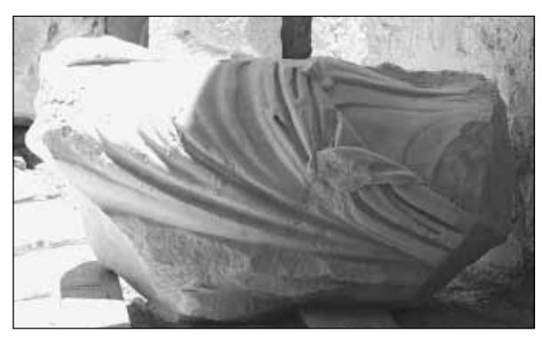
9. Fragment of a togate man, 75-100 AD, marble, Decumanus Maximus near Nymphaeum, Gadara/Umm Qays.

The quarry origins of the marble of a particular sculpture may be suggested by a variety of scientific methods. Beginning in the 1970s,