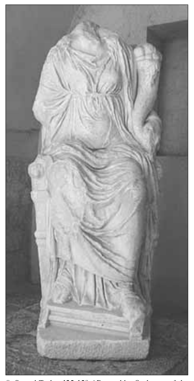
8. Seated Tyche, 125-150 AD, marble, Orchestra of the West Theater, Gadara/Umm Qays.

wide, and .31m deep. The piece may be dated to the late Flavian or early Trajanic period (last quarter of the first century AD), based on the nature and arrangement of its toga, from which the sinus and umbo are still well-preserved.