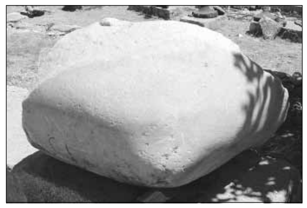
7. Colossal elbow, 3rd century AD?, marble, immediate area of the Great Temple, Amman.

rial; alternately, it could be evidence of repairs in antiquity. The exact identity of the original piece remains unclear; some scholars have argued that the veins indicate that the piece depicted a male deity, while others argue that the slender, elongated nature of the fingers suggest a