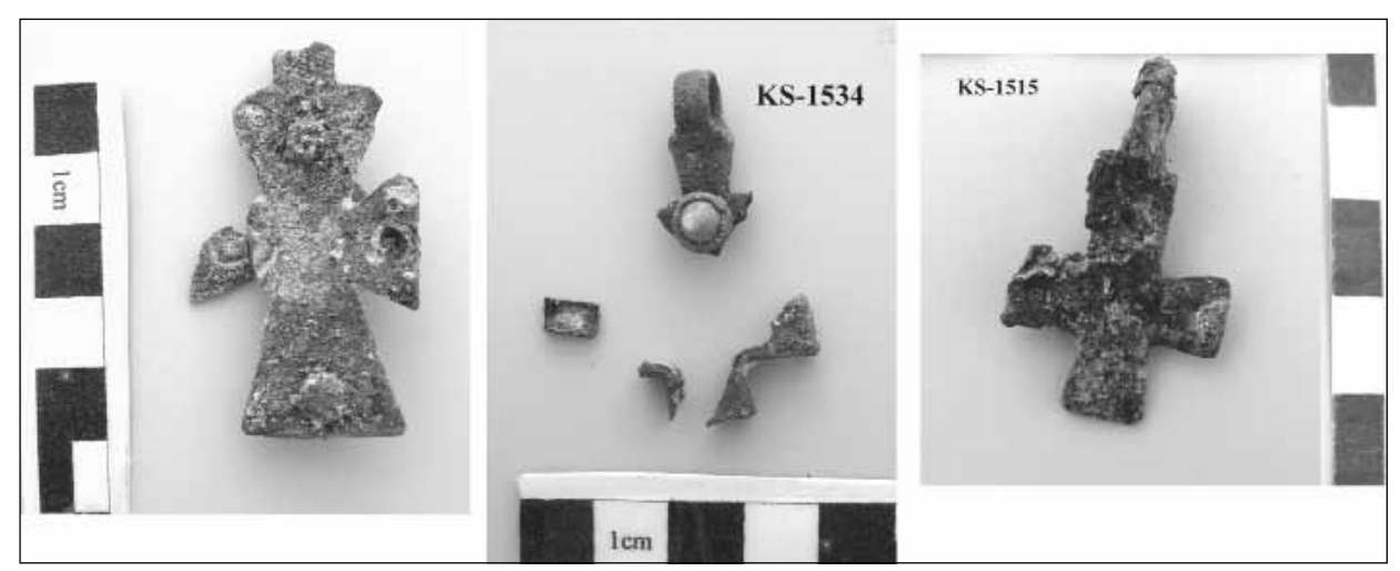
1. Cross-shaped objects. a bronze (KS-1515) and a broken silver (KS-1534) pendant. Possible bronze buckle (KS-1559) and iron rod (KS-1558).

ence and association with the iron rod (dagger!) in an infant burial remains unclear.