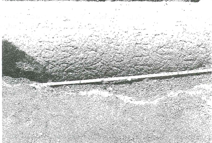
Fig. 2. — Roman Milestone.