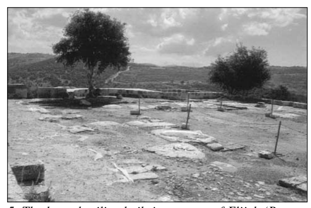
5. The large basilica built in memory of Elijah (Rustom Mkhjian).