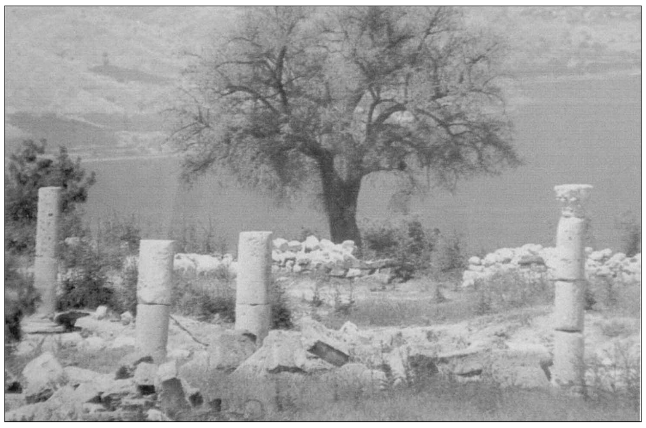
8. A view from Umm Qays with Lake Galilee in the background (Rustom Mkhjian).