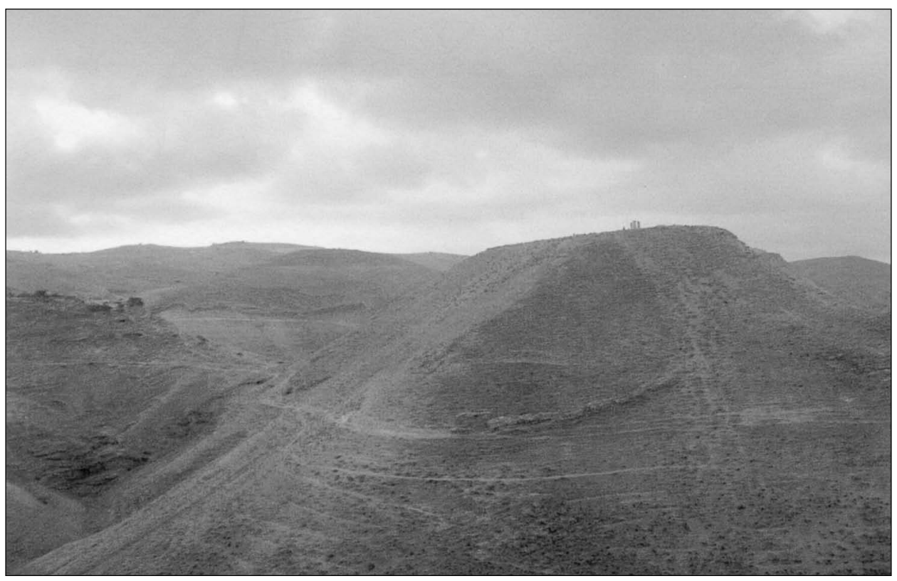
7. A general view of Macharius (Rustom Mkhjian).