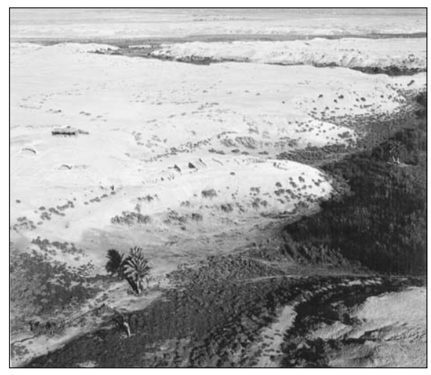
1. A helicopter view of Bethany beyond the Jordan.