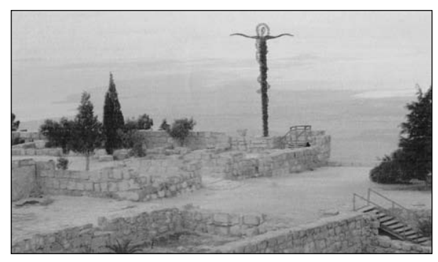
3. A view from Mount Nebo to the Jordan valley plains (Rustom Mkhjian).