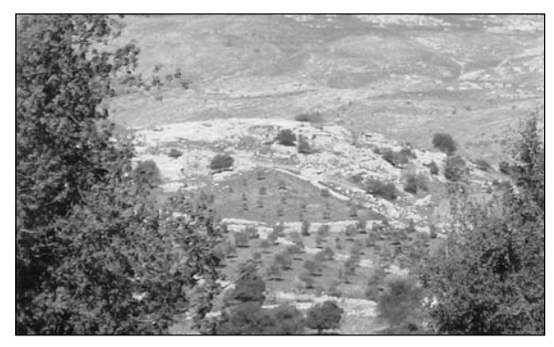
4. View of Listib from the east (Rustom Mkhjian).