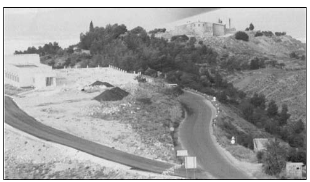
2. A helicopter view of Mount Nebo from the east (Rustom Mkhjian).