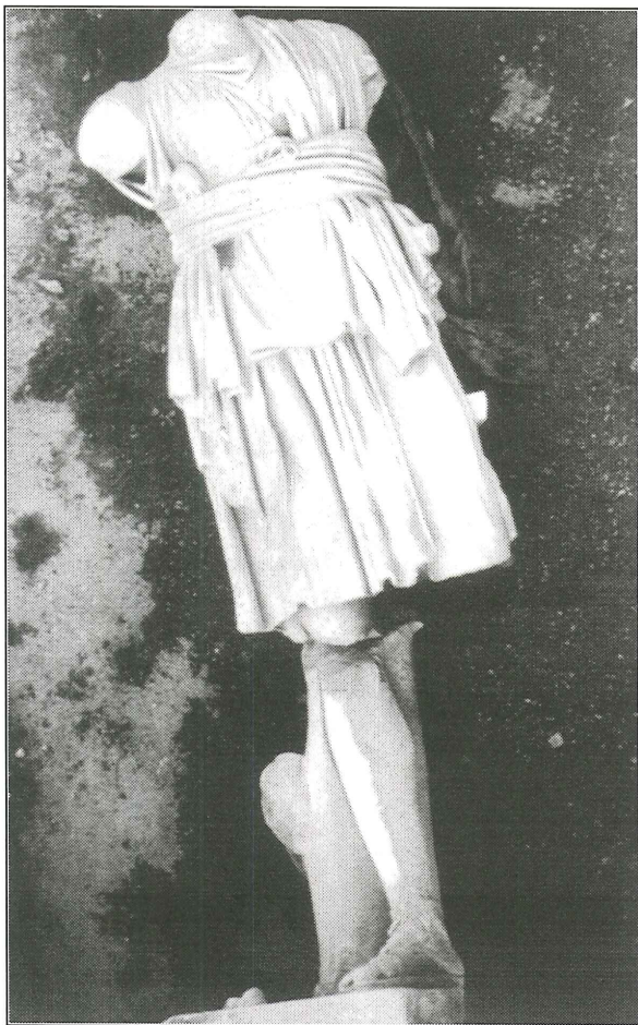
1. Front view of the Abila Artemis.