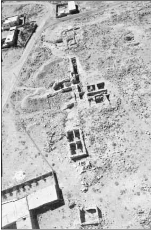
2. Oblique aerial photograph of the excavation area, taken by D. Kennedy in 2009 (Ref. APAAME_20090930_DLK-0299).

one open area had been excavated. The archaeological finds can be summarised as follows: