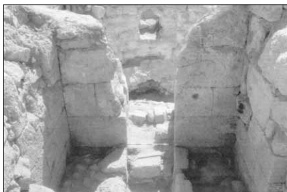
5. Doorway of the interval tower in Square 02.

stone, under which is an arrangement of stones bedded into the ground to form an entrance or 'mouth'. The function of this hole is puzzling and, at this stage, it can be suggested — amongst other hypotheses — that it was part of a drainage system, or perhaps simply a cistern to collect rainwater. The architectural features in the open area around the interval tower are indeed remarkable. The tower's original architecture