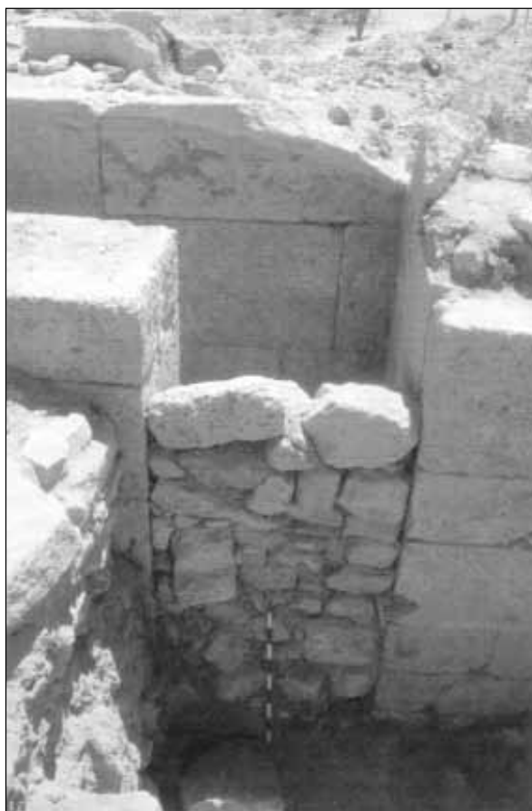
4. Roman staircase in Square 03, blocked by a later wall.

Significantly, the area within Square 02, which is accessed by the doorway is paved with rectangular slabs. Right in the north-west corner of the same square and contiguous to the paved floor, a twelve metre deep hole was discovered. The shaft opening was covered with a large