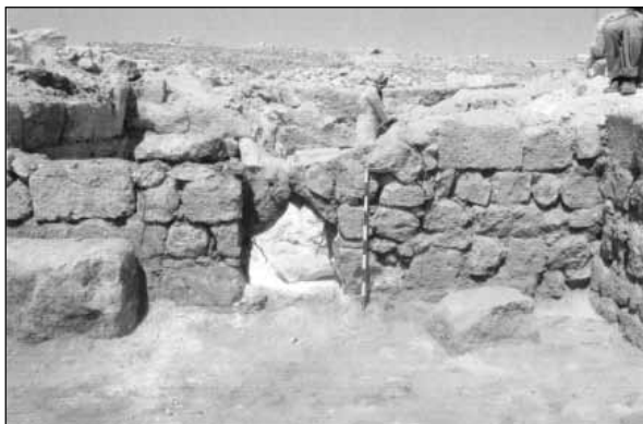
6. Partition wall in the centre of the interval tower, in the open excavation area. The lime kiln is behind the wall; the aperture in the centre was used to feed the kiln with charcoal.

The quantity of pottery recovered this season is far less than that recovered in 2008. However, the quality and typologies represented are quite different. A preliminary reading was indicative